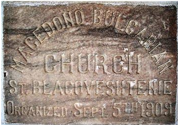
Pictures of various Macedonian-Bulgarian churches and events in the USA.

Resolution 741 claims that they are "Macedonian"